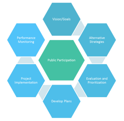
Figure 3 The Transportation Planning Process

It is essential to extend public participation to all interested citizens who are served by the transportation system and transportation services in the metropolitan area. This Participation Plan strives to fulfill at least one goal of the CCV, "to develop regional leadership in local governments that promotes transparency, citizen engagement, and coordinated delivery of government services."