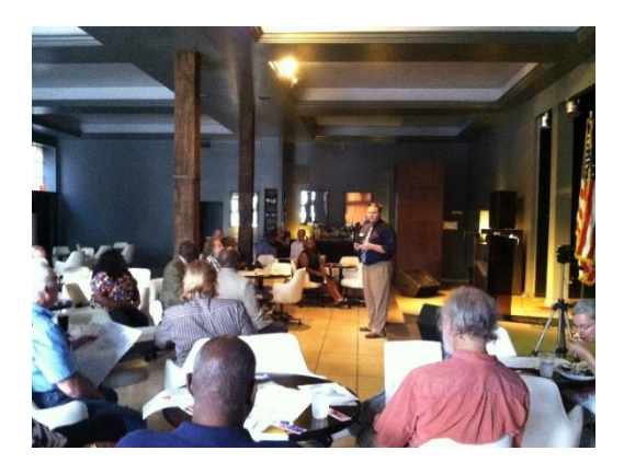
Figure 2 Staff Speaking to a Group of Interested Citizens